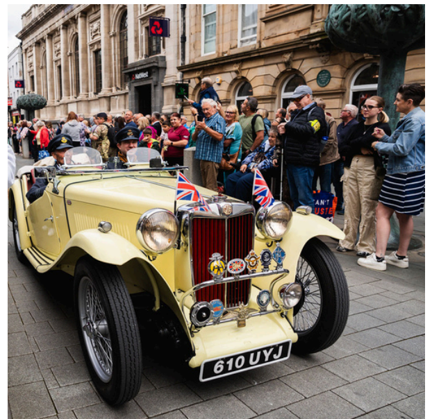
All Armed Forces Day photo credits to Ben Harrison Photography