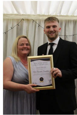
Charity of the Year Doncaster Culture & Leisure Trust