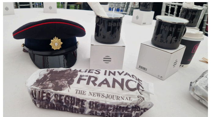
The traditional fish and chips and commemorative mugs presented to guests