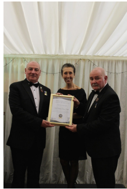
Business of the Year Victoria Cross Trust