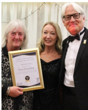
Innovation Award People Focused Group