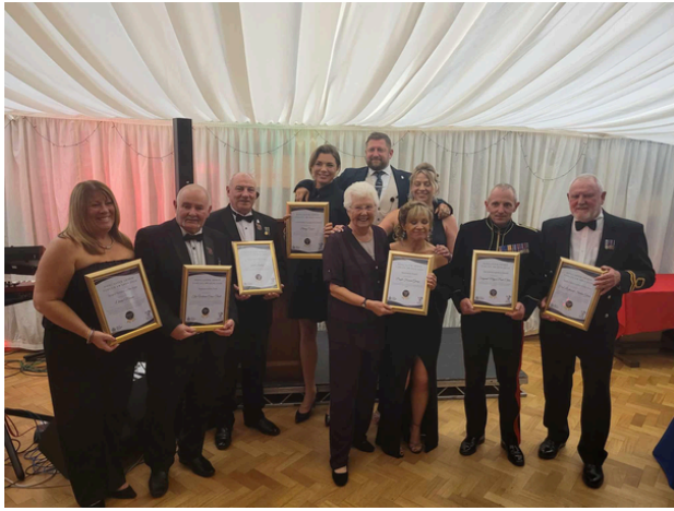
The first ever Doncaster Armed Forces Covenant Awards Evening in October 2024

It is a great honour to be asked to write the Foreword for this packed edition of the Doncaster Armed Forces' Covenant Newsletter.